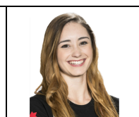
Kaetlyn Osmond 3-time Olympic Medalist 2018 World Champion