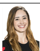
Kaetlyn Osmond 3-time Olympic Medalist 2018 World Champion