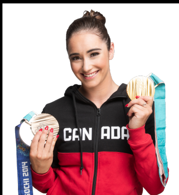
LESSONS WITH KAETLYN LEARN FROM A CHAMPION TO ELEVATE YOUR SKILLS & MINDSET