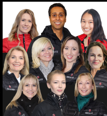
INTERNATIONAL LEVEL COACHES HELP YOU REACH YOUR FULL POTENTIAL