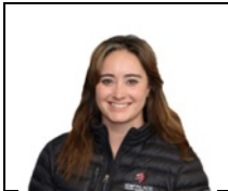
Kaetlyn Osmond NCCP National Coach In Training Olympic & World Champion 6 years coaching experience